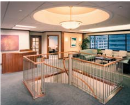
VIEW SHOWING 10TH FLOOR