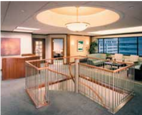
VIEW SHOWING 10TH FLOOR