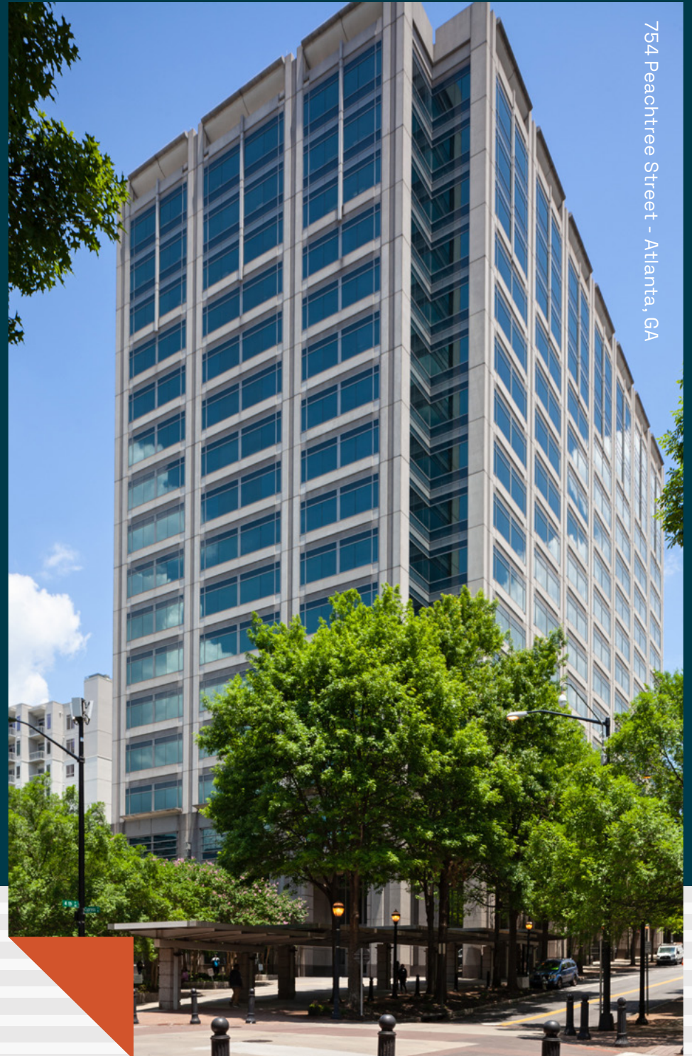
754 Peachtree Street - Atlanta, GA