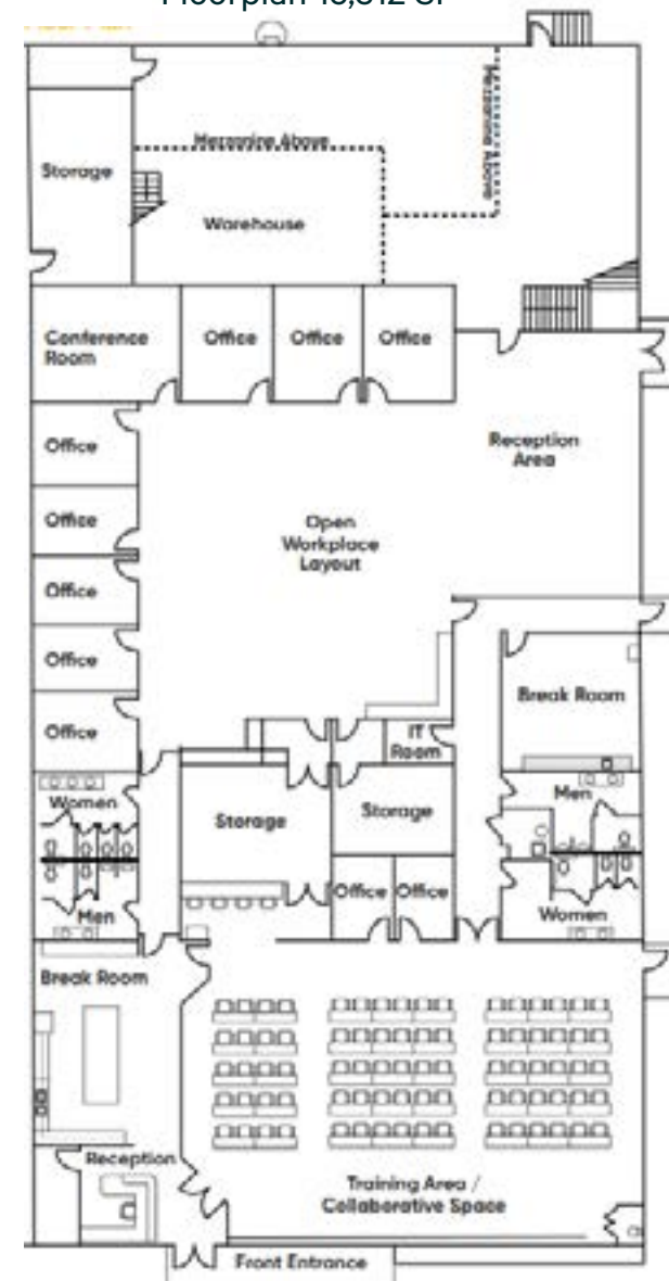
Floorplan 15,312 SF