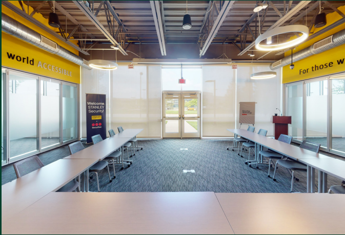
First Floor Main Conference Room