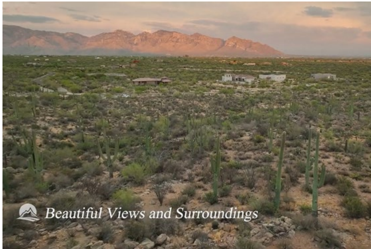
Beautiful Views and Surroundings