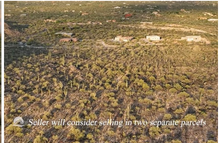
Seller will consider selling in two separate parcels