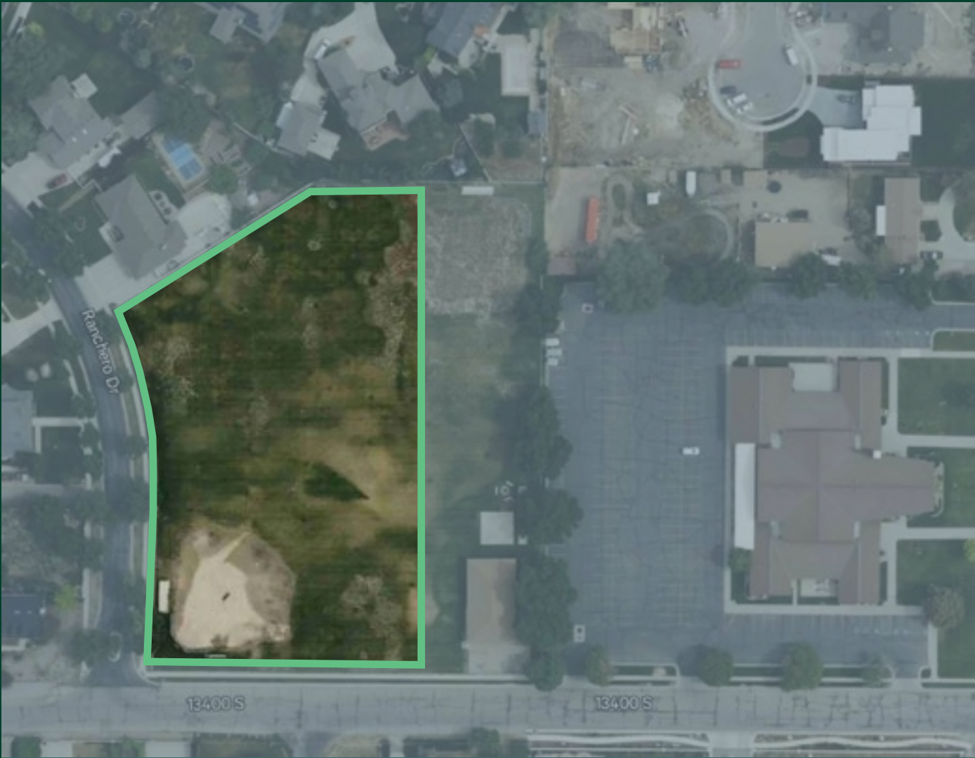
Parking and Church building not included in sale.