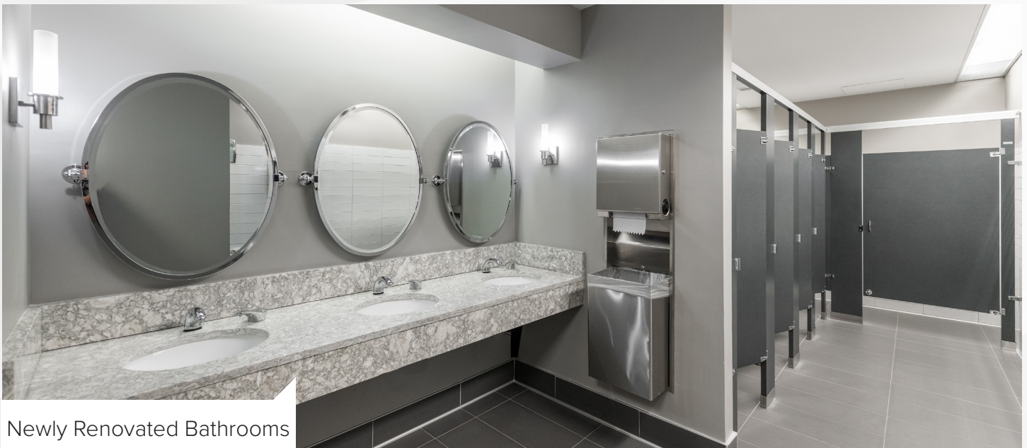
Newly Renovated Bathrooms