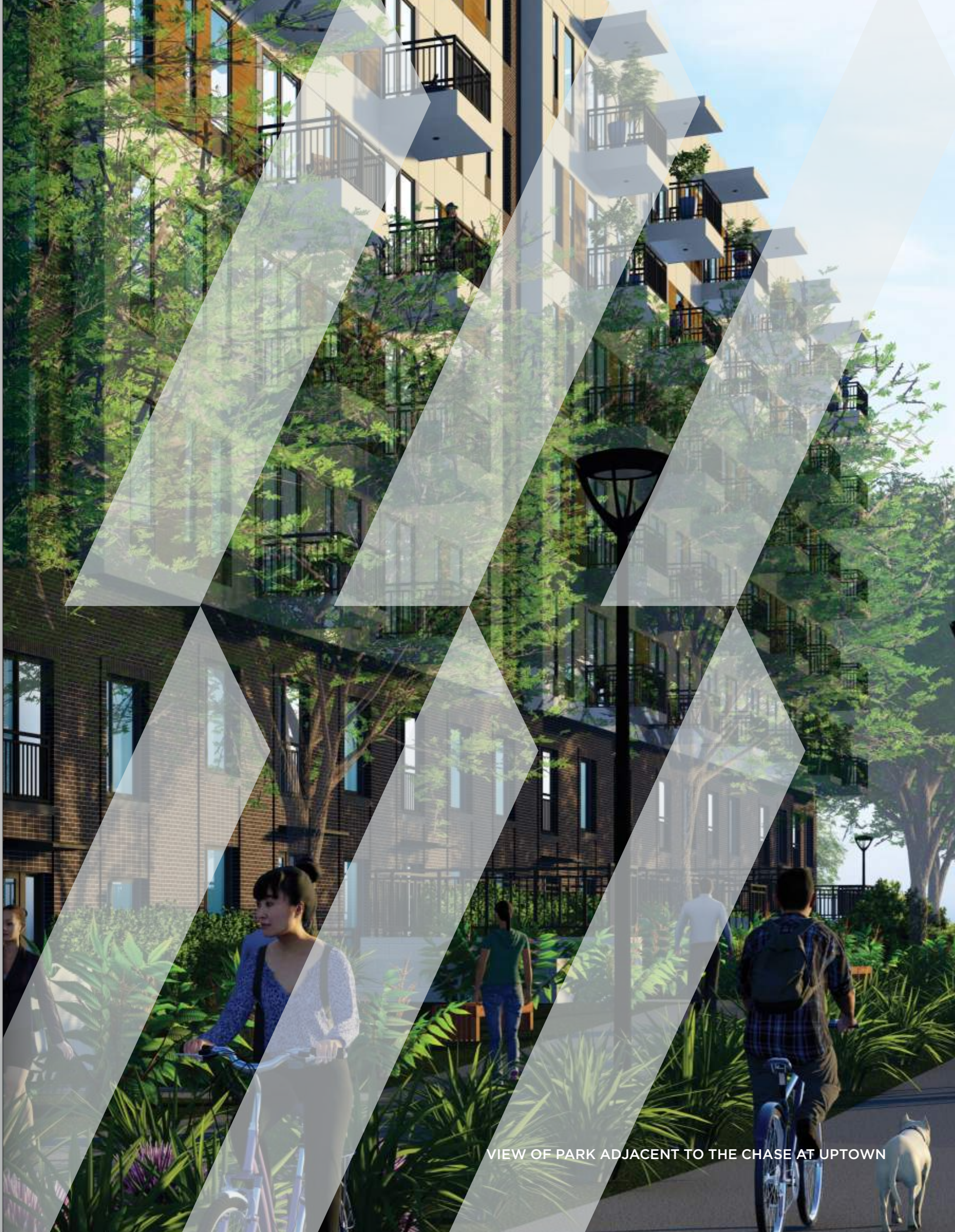
VIEW OF PARK ADJACENT TO THE CHASE AT UPTOWN