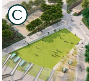
CONFETTI SPORTS PARK: 1.4 ACRES OF ACTIVATED OUTDOOR SPORTING FACILITIES