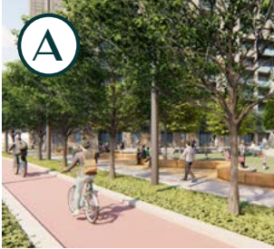
TRIANGLE PARKS: 1.5 ACRES COMBINED