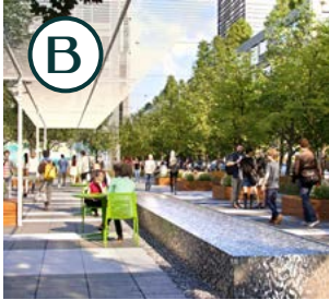
UPTOWN COMMONS PARK: 1 ACRE