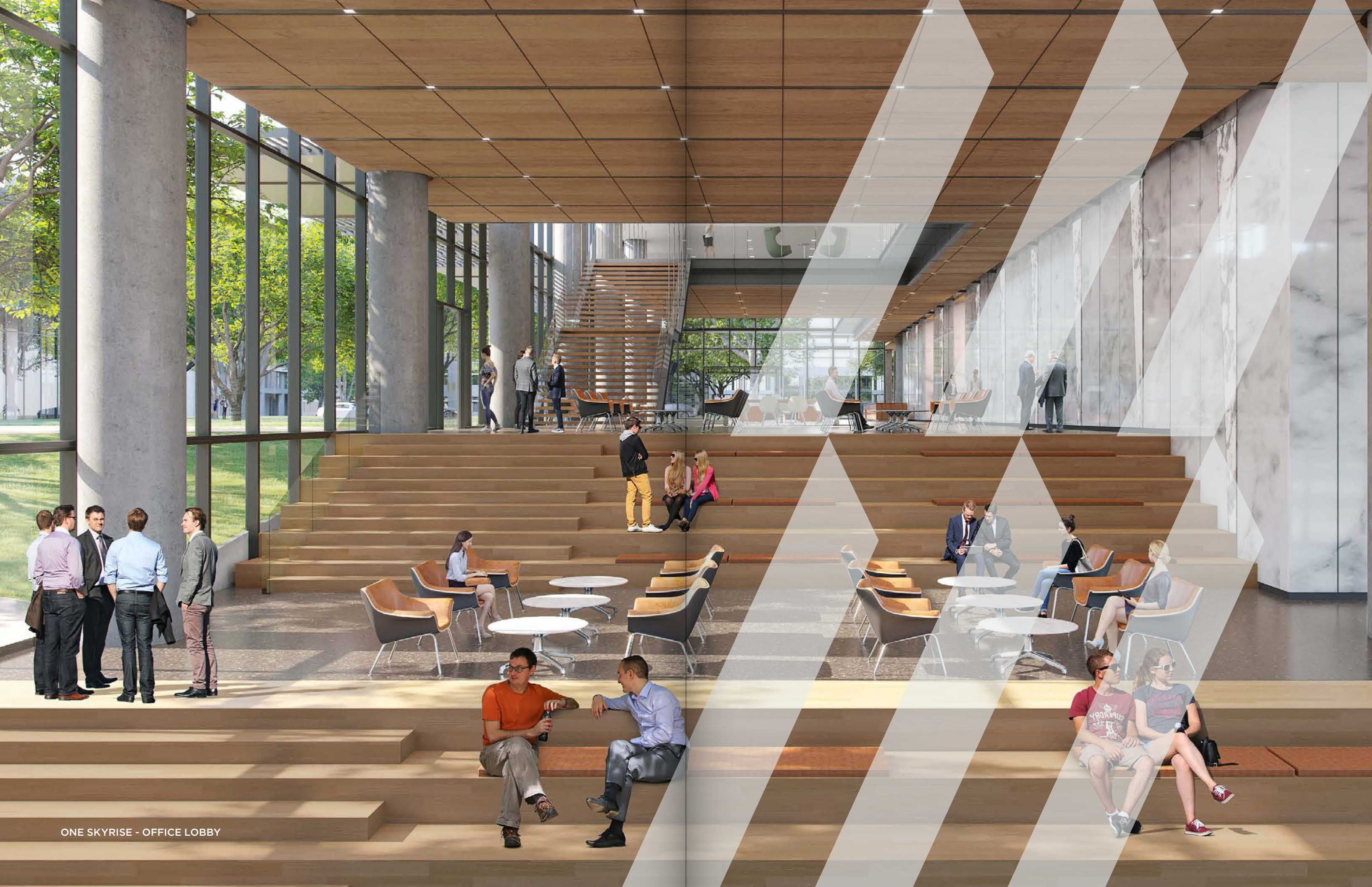
ONE SKYRISE - OFFICE LOBBY