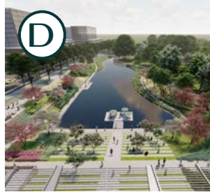
WALNUT SPRINGS LAKE PARK: 6.9 ACRES