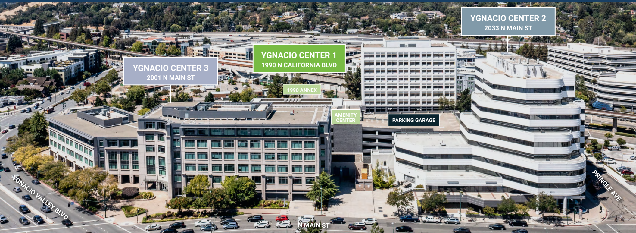
YGNACIO CENTER 2 2033 N MAIN ST