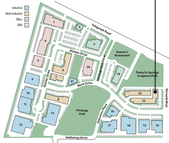
FLOOR PLAN SCALE: N.T.S.