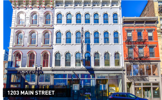
1203 MAIN STREET