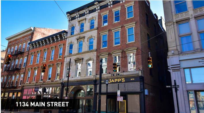
1134 MAIN STREET