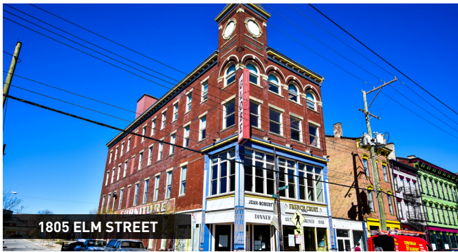
1805 ELM STREET