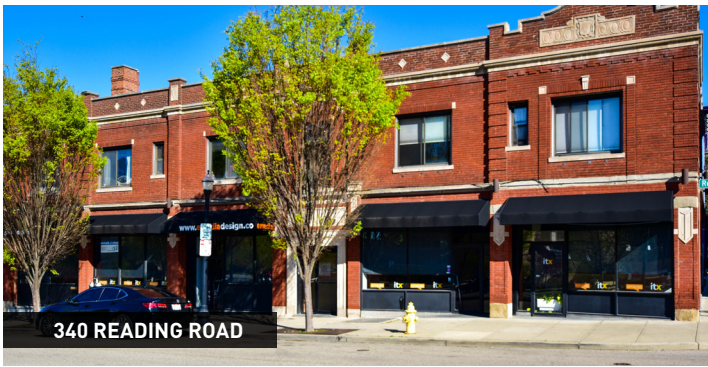
340 READING ROAD