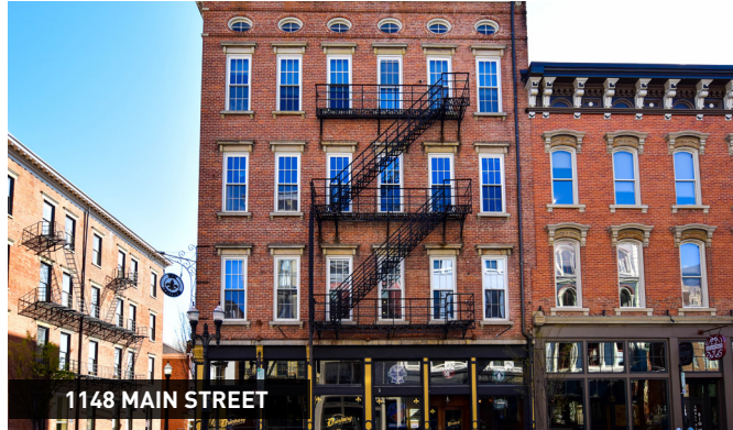
1148 MAIN STREET