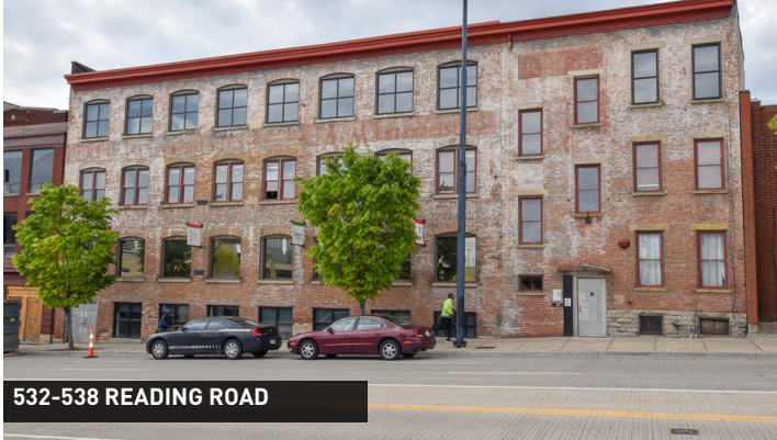
532-538 READING ROAD