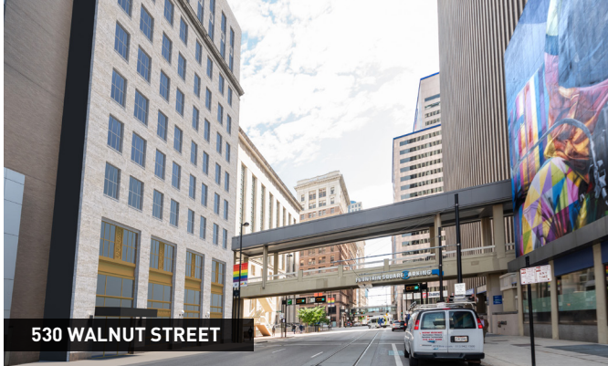
530 WALNUT STREET