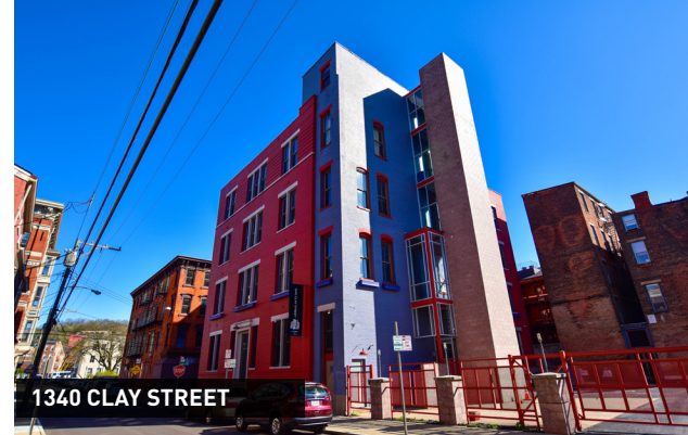
1340 CLAY STREET