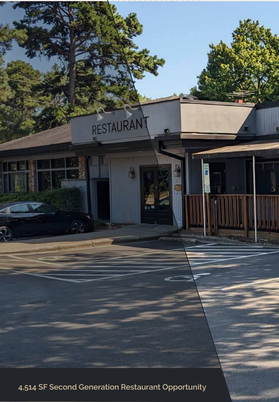
4,514 SF Second Generation Restaurant Opportunity