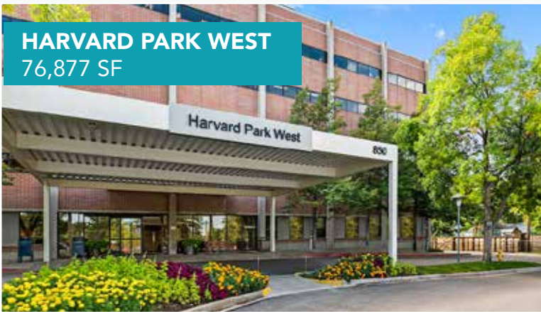
HARVARD PARK WEST 76,877 SF