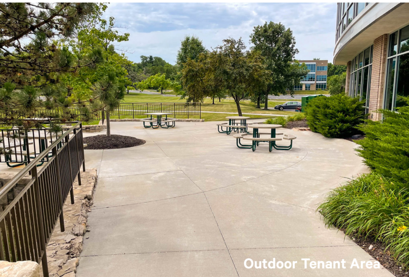
Outdoor Tenant Area